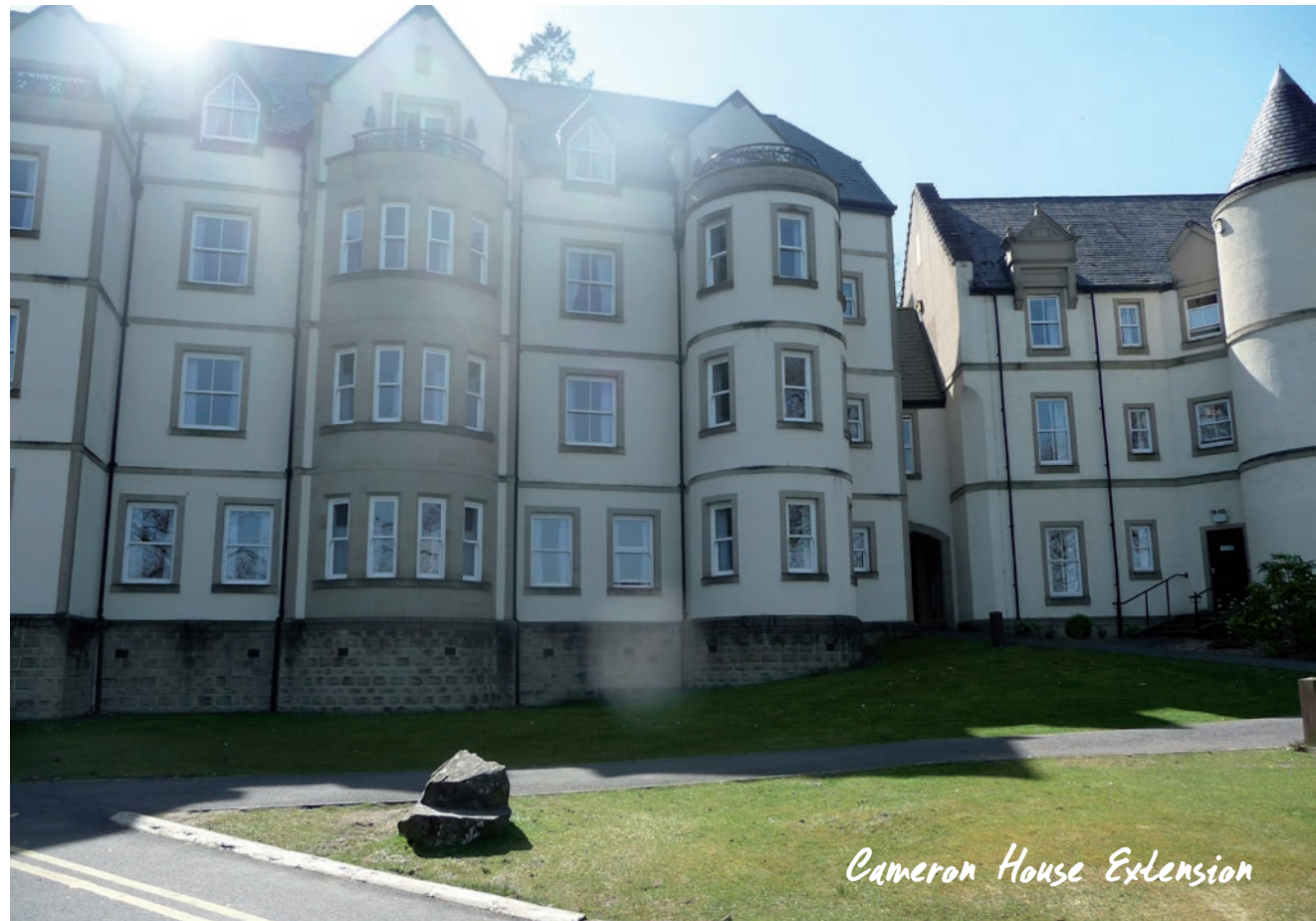
Cameron House Extension

The aim of Visitor Experience Policy 3 is to safeguard existing tourism sites. Therefore, we would not be supportive of proposals for change of use of existing tourism accommodation, unless it can be demonstrated that it is not feasible to continue for any reason including lack of demand for the facility or, if selling, a lack of buyer, or where there is adequate provision for that particular type of tourism business in the locale. We would expect a business to have been actively marketed for a year at least and evidence to be provided to demonstrate a lack of demand for the business to be submitted with any application for a change of use. If a change of use to housing is proposed then please see our housing policy for guidance.