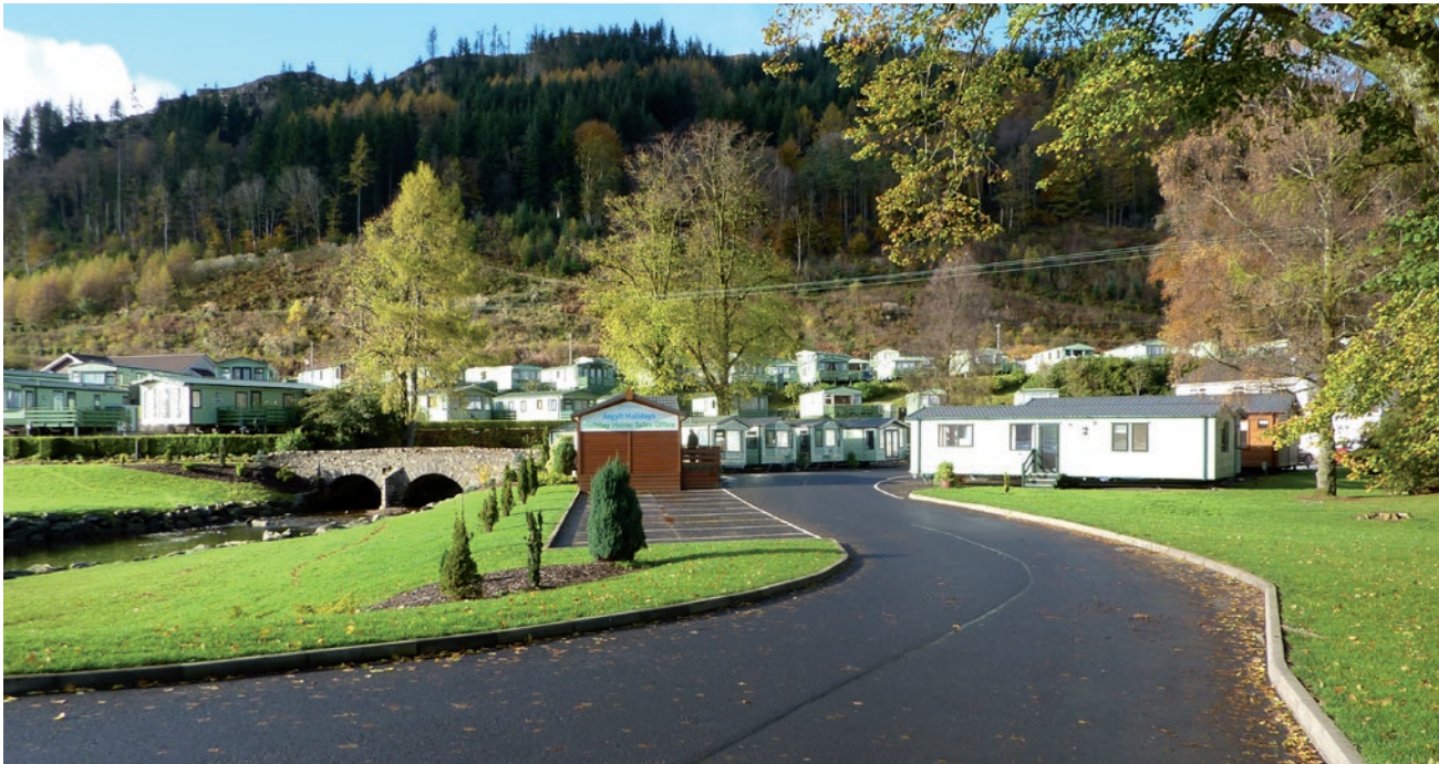
Existing Holiday Park, Drimsynie