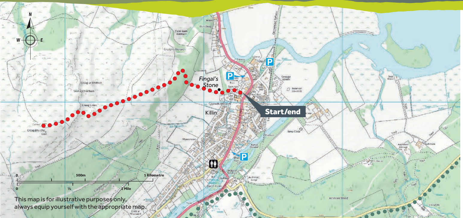
This map is for illustrative purposes only, always equip yourself with the appropriate map.

Sron a' Chlachain, "the peak that resembles a nose above the village", is situated on the west side of Killin. This route is a hill path with an ascent of 400 metres (1300ft). Most of it is typical of an upland path as the surrounding habitat is a mixture of rough grazing, giving way to heath and moor at a higher altitude. Walkers are rewarded for their hard work with extensive panoramic views over Killin, Loch Tay, Glen Dochart and Glen Lochay.