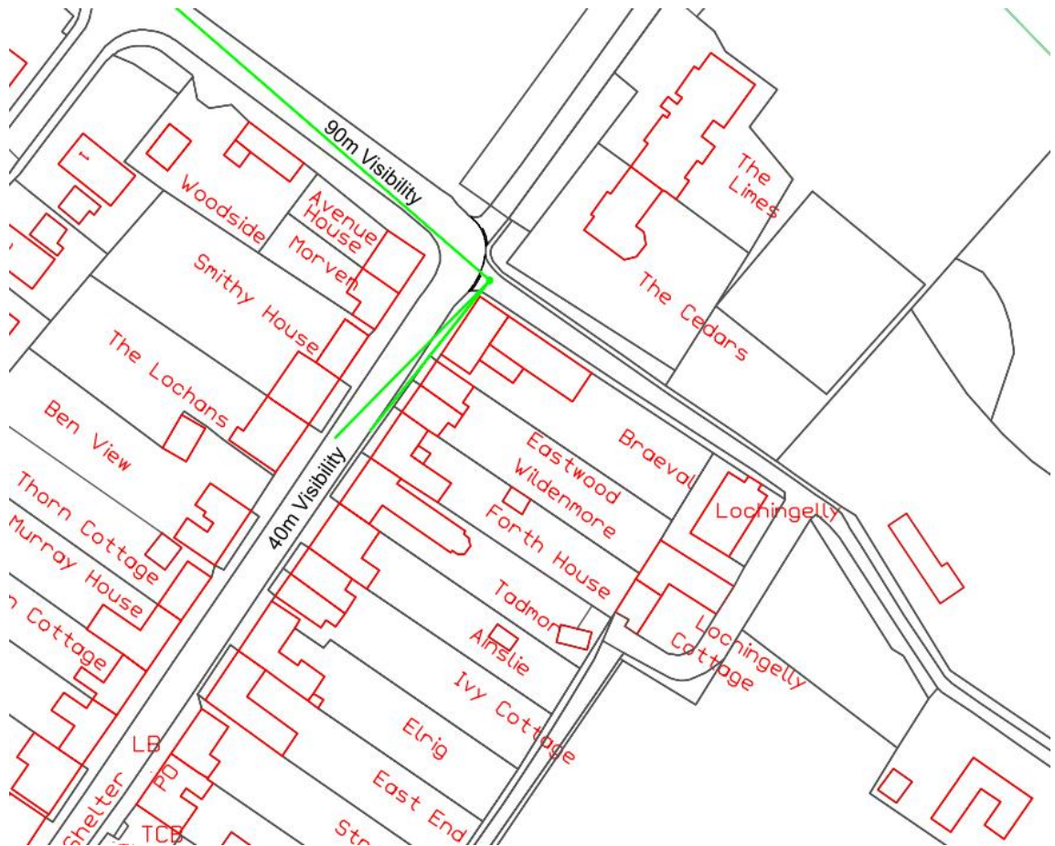
Figure 1.7 Visibility Splays

Designing Streets recommends a visibility splay for a 20mph speed limit of 2.4m x 25m (adjusted for bonnet length). The SCOTS guidelines does not provide details for a 20mph speed limit but does recommend a visibility splay of 2.4m x 43m for a 30mph speed limit. Both the Designing Streets and the SCOTS guidance visibility splays can be achieved from the existing Park Avenue access.