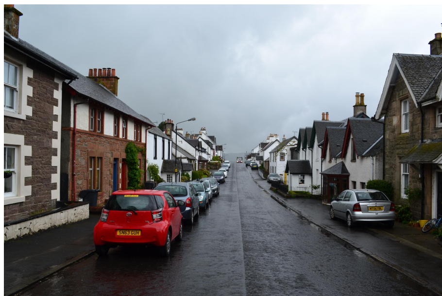
Figure 1.1 Main Street, Gartmore

Main Street is the main bus route through the village and as a result of this on-street parking only takes place on the eastern side of Main Street in order to allow the safe passage of the bus. Figure 1.1 below shows a view of Main Street.