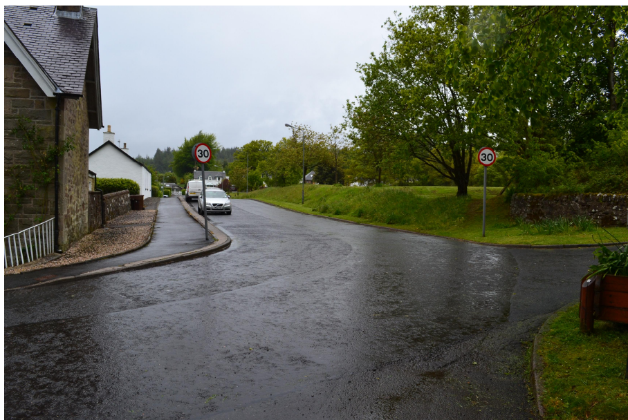
Figure 1.6 Visibility to the left