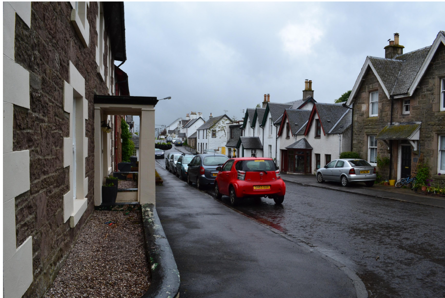
Figure 1.5 Visibility to the right

Visibility from the Park Avenue junction is good with visibility to the right, following the line of Main Street and therefore uninterrupted, is in excess of 90m. From the Park Avenue access it is possible to see to the end of Main Street past its junction with Cayzer Court. To the left visibility is also good with appropriate visibility for the mandatory 20mph speed limit achievable. Cars do park on the east side of Main Street however even with these parked cars a clear view of Main Street and oncoming traffic from the left is easily achievable. Figures 1.5 and 1.6 show the visibility to the left and right from the Park Avenue access with Figure 1.7 showing the visibility splays.