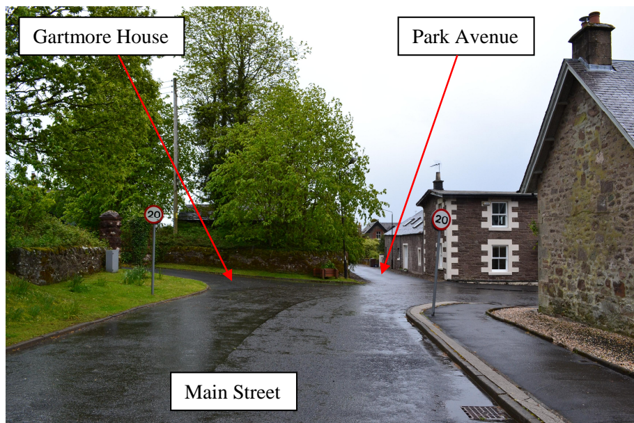
Figure 1.4 Gartmore House and Park Avenue Junctions with Main Street

A typical view of the Park Avenue and Gartmore House junctions are shown below in Figure 1.4