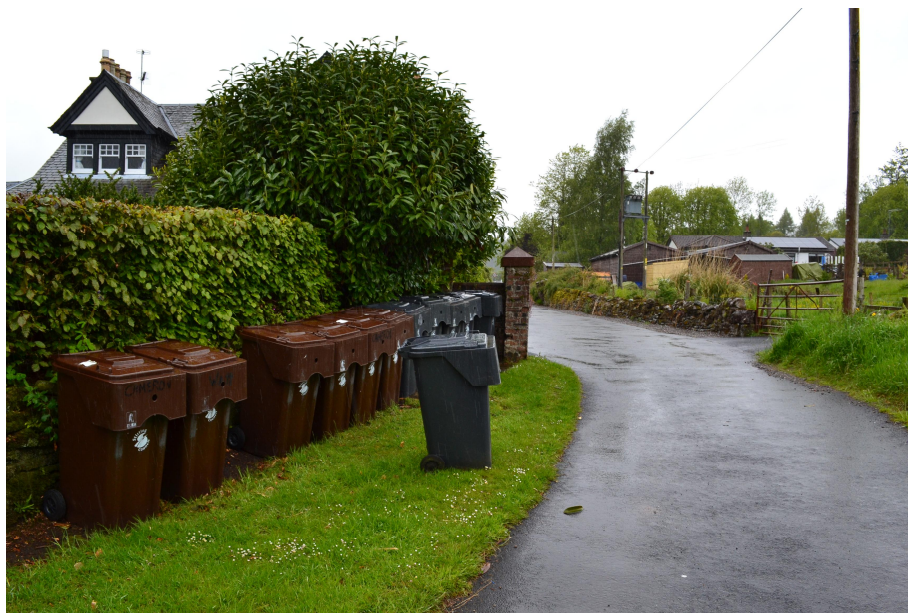
Figure 1.8 On Street Bin Collection.

The proposed development site will be served by an extension to Park Avenue with a new access created adjacent to Lochingelly. This will be formed in an appropriate manner in line with Designing Streets and Stirling Councils Development Guidelines. On street bin collection currently takes place on Park Avenue, see Figure 1.8, and this will be provided for the new development.