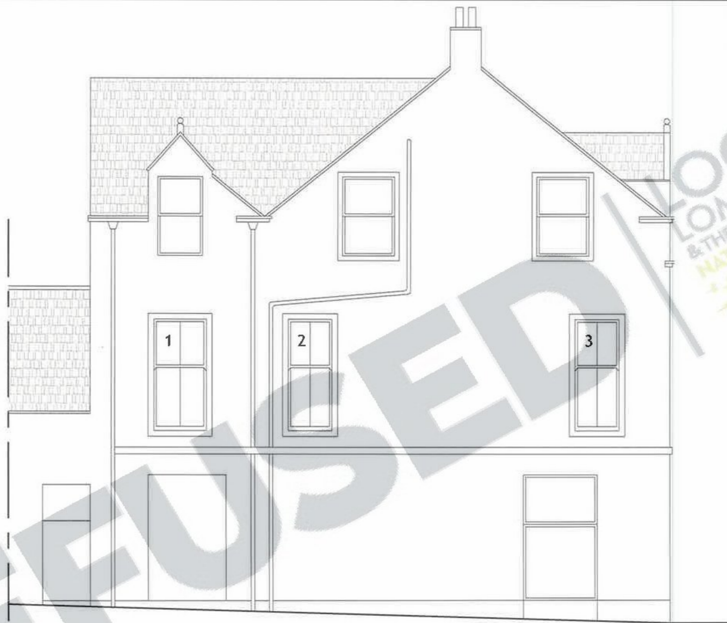
Existing Elevation Scale 1:100