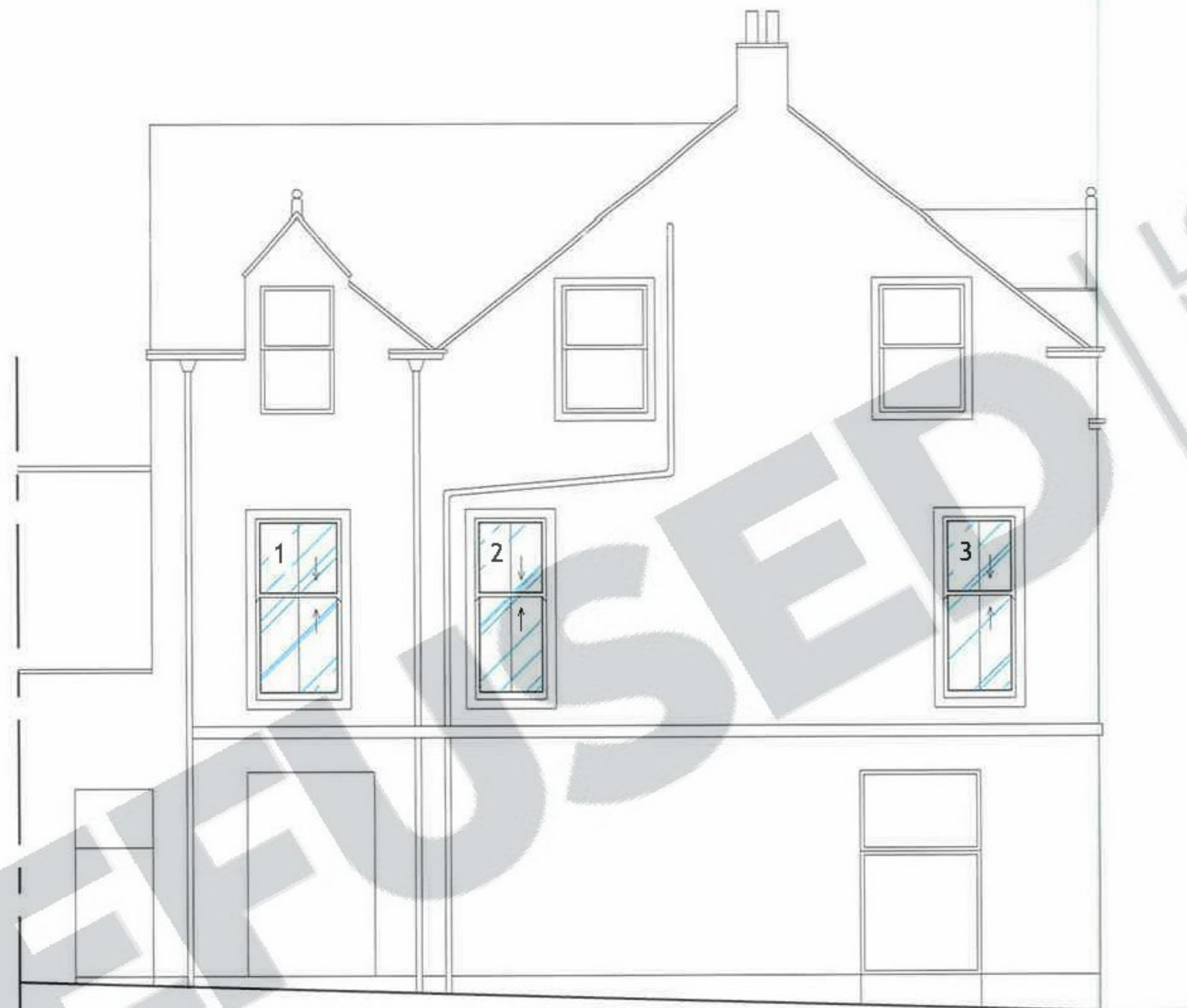
Proposed Elevation Scale 1:100