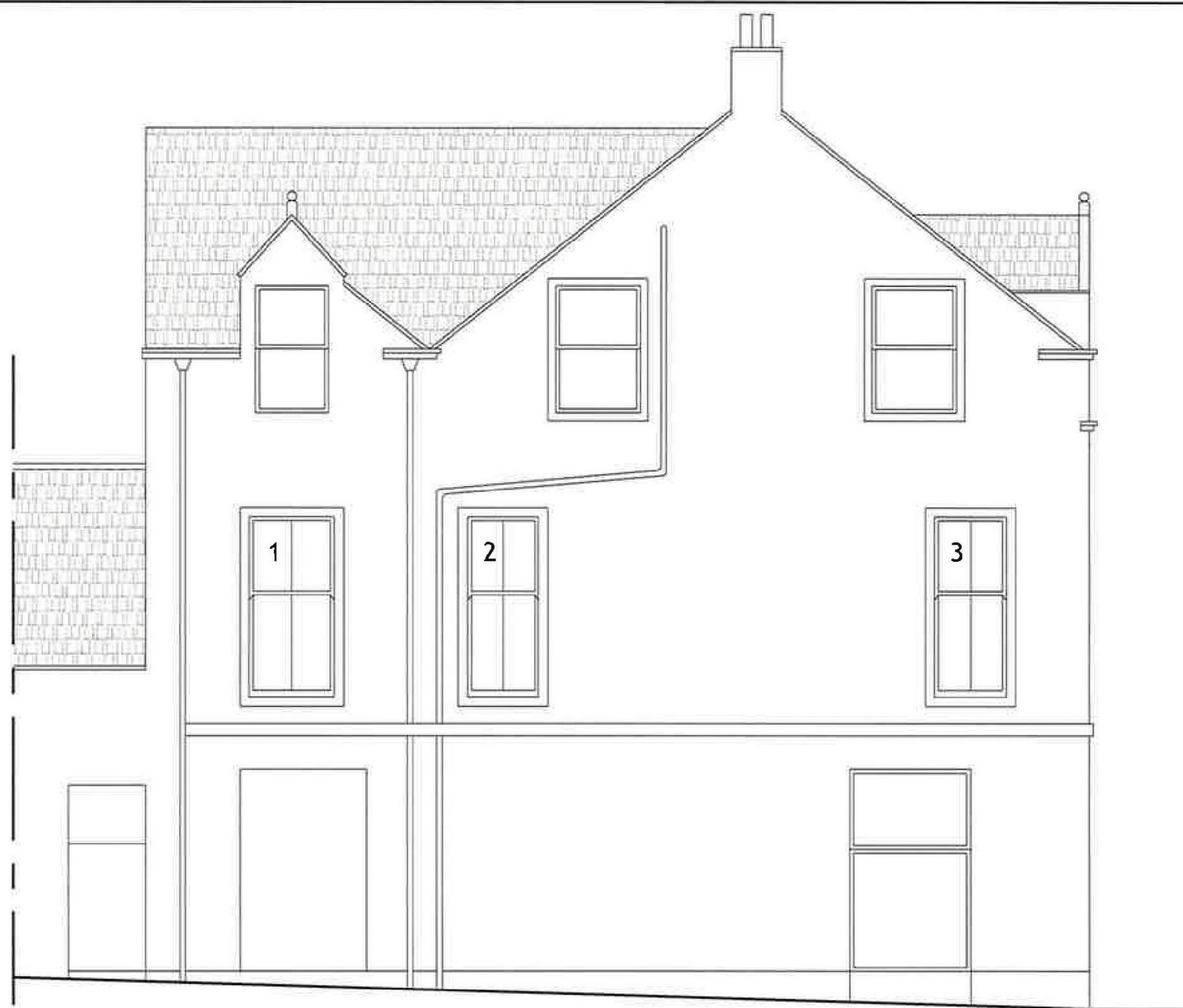
Existing Elevation Scale 1:100