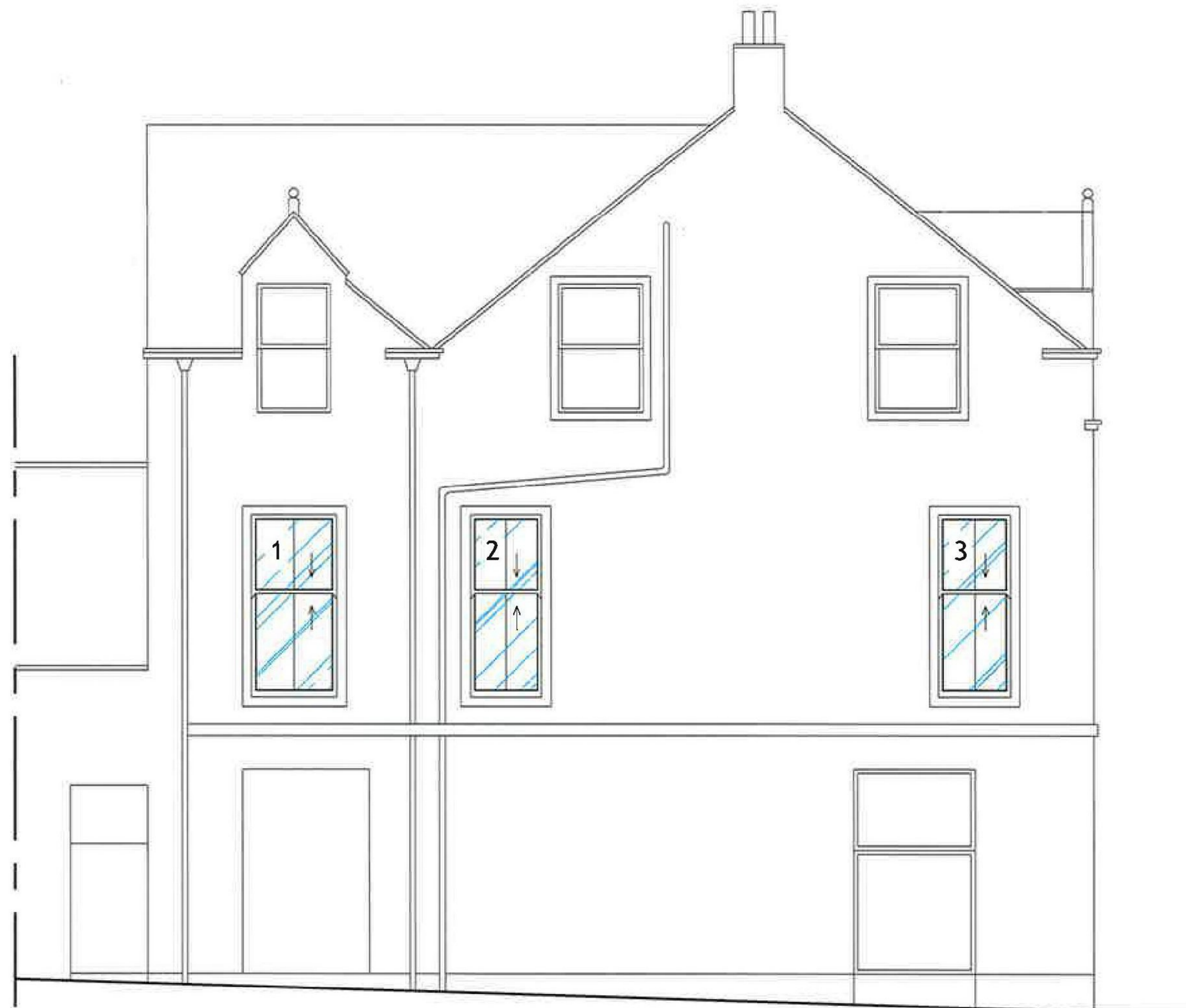
Proposed Elevation Scale 1:100