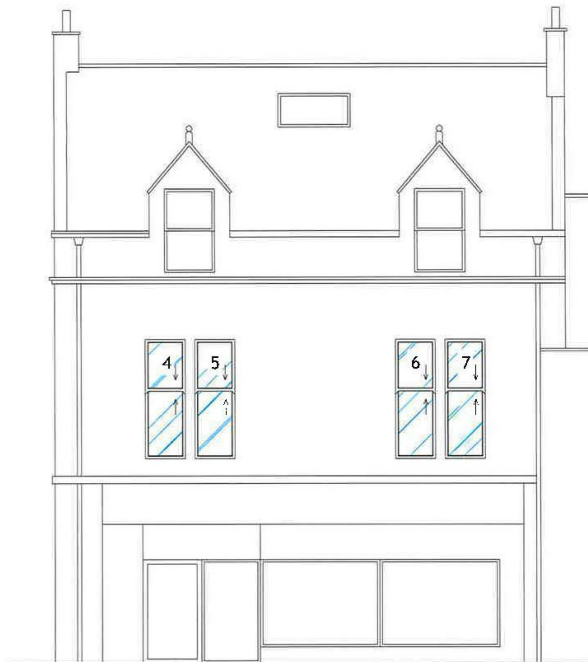
Proposed Elevation Scale 1:100