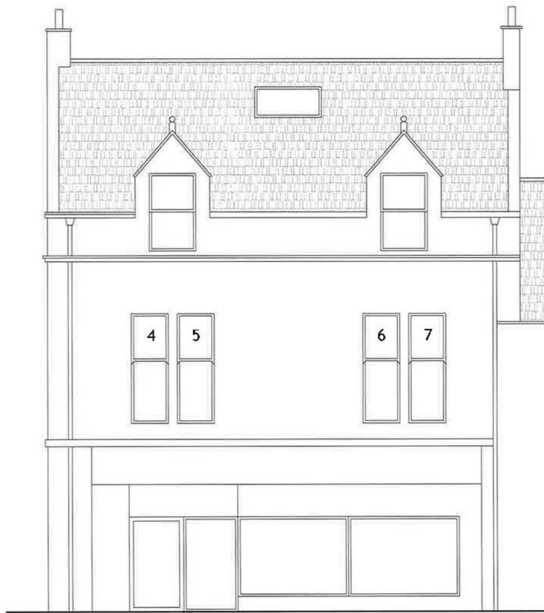
Existing Elevation Scale 1:100