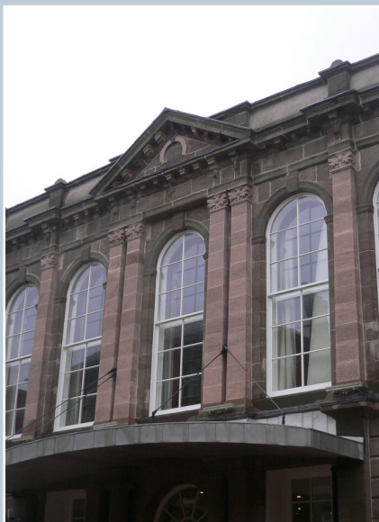
Webster Theatre, Arbroath. Large clear sheets of internal secondary glazing were installed here during recent refurbishment.