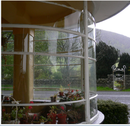
A distinctive, metal framed bay window at the Crook Inn, Tweedsmuir, Peeblesshire.