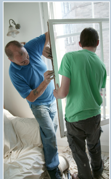
Repairing the sash cords of a timber sash and case window. Most components of a traditional window can be repaired without the waste of replacing the whole unit.