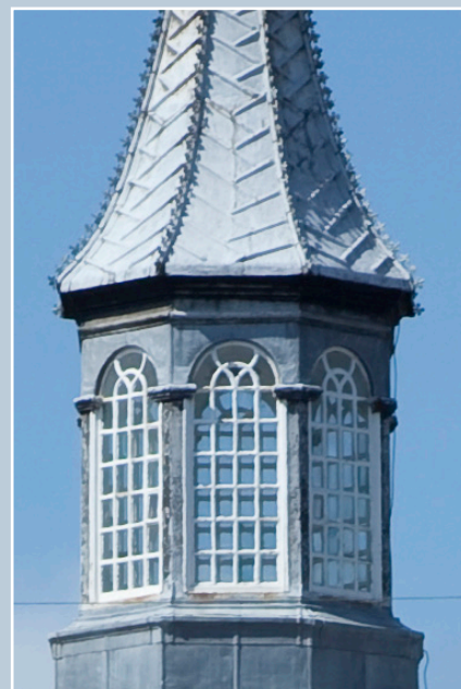
Fixed small-pane windows in the cupola of Robert Gordon's Hospital, Aberdeen, designed by William Adam in 1731–32. Thick astragals (glazing bars) and small panes of glass are typical of this period of design.