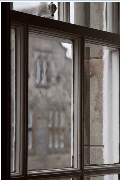
Detail of a timber sash and case window of circa 1890 showing the profile of the astragals, the irregularities of the glass, and a decorative sash fastener.