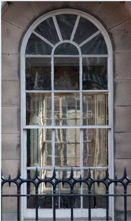
Signet Library, Parliament Square, Edinburgh, circa 1810. A round-headed cylinder glass sash and case window with slim 'astragals', or glazing bars. Irregularities in the glass provide the variety and individuality of the reflective pattern.