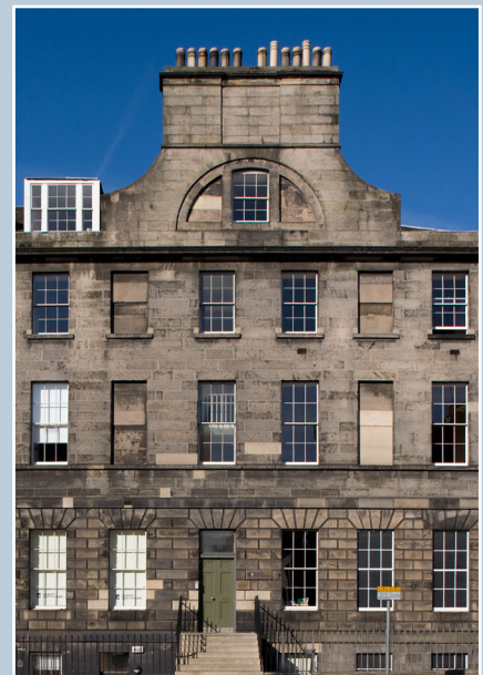
South Charlotte Street, Edinburgh. The blind openings are detailed with sills and a 'meeting rail' to maintain the symmetry of the architectural elevation. The chimney flues pass behind the blind windows.