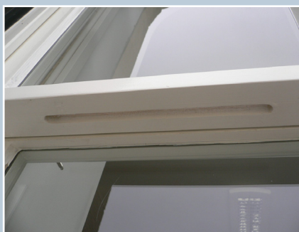
A view of the underside of the meeting rail of a new timber sash and case window at Castlemilk Stables, Glasgow. A discreet slot ventilator in the meeting rail allows ventilation without the need for obtrusive external fixtures.