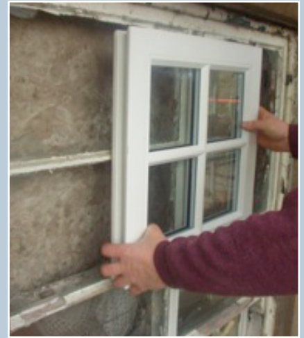
Details of proposed replacement windows should be checked against the originals where possible. In this case the astragal profiles of the sample replacement window are too thick and flat, and would not be an appropriate match for this situation.