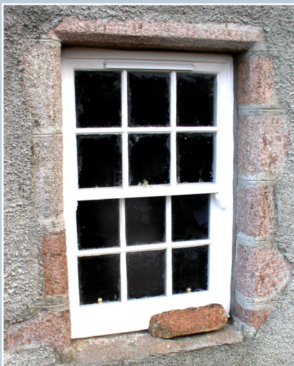
A new single-glazed window detailed to match the previous window, except that horns have been added to the top sash, not necessary where the astragals give rigidity, and a 'permavent' has been added. See page 7 for an alternative ventilation method.

also decorative, contributing to the interest and character of a window.