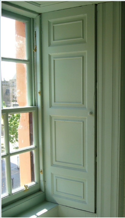
Associated fixtures such as traditional timber shutters contribute to the interest and character of a window.