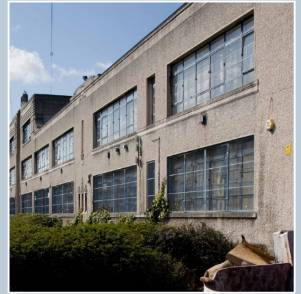
Former Niddrie Marischal School, Edinburgh. Designed in Art Deco style in 1935 by architects Reid & Forbes. The strips of blue-painted steel windows have two opening methods: horizontal pivots and small hoppers. The ground-floor windows are protected from vandalism by discreet metal mesh screens painted in the same colour.