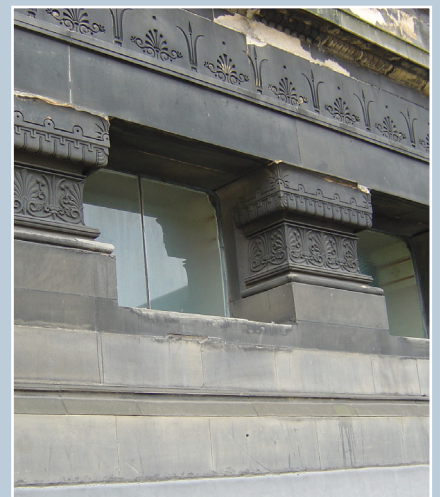
St Vincent Street Church by Alexander 'Greek' Thomson, St Vincent Street, Glasgow. Thomson's Graeco-Egyptian designs emphasised the solid monumentality of the masonry against the void of the window openings. He used large sheets of plate glass and minimal frames to achieve this effect.