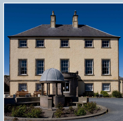
Banff Castle, Aberdeenshire. Here the size of the windows at the first floor indicate that this was the principal storey where the public rooms were located. The symmetrical arrangement and careful proportioning of the windows is the main architectural feature of the building.