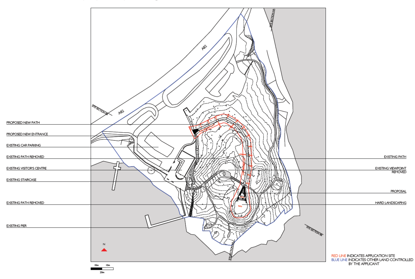
Fig. 5: Site plan as proposed.

3.3 The area provides a recreational and scenic viewpoint opportunity in association with the existing visitor centre. The proposal will enhance and improve the existing visitor offering as shown in the proposed plan, Figure 5 , below.