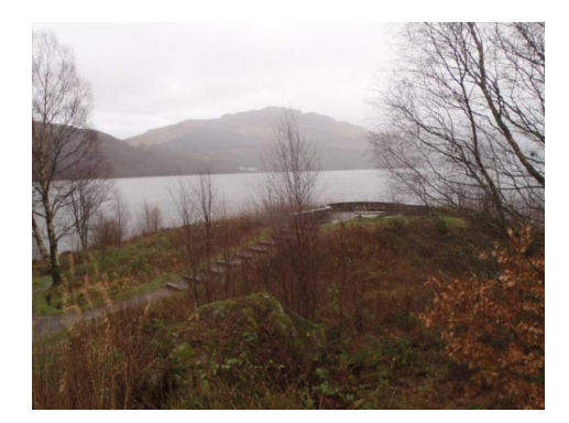
Fig. 4: Photo taken from existing view point 1 looking towards view point 2 and Loch Lomond. Inversnaid Hotel is partially visible on the other side of the loch.

3.3 The area provides a recreational and scenic viewpoint opportunity in association with the existing visitor centre. The proposal will enhance and improve the existing visitor offering as shown in the proposed plan, Figure 5 , below.