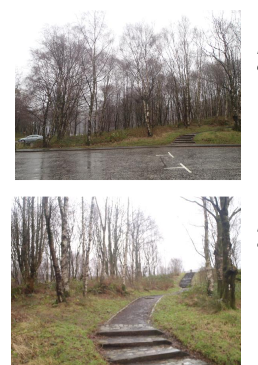
Fig. 2: Existing woodland footpath access from car park.

3.2 The wooded area of the wider site contains a network of small formal and informal paths with two small viewpoints providing views over Loch Lomond (see Figures below).