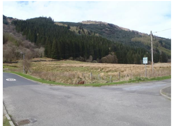
Fig. 2: Existing site