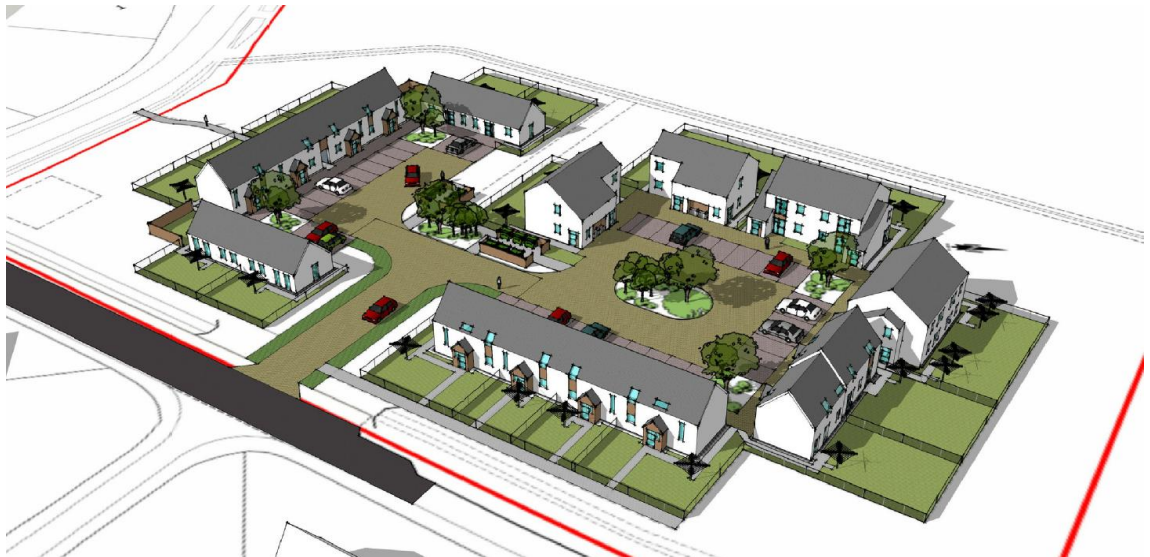
Fig. 6: 3D view of proposed development.