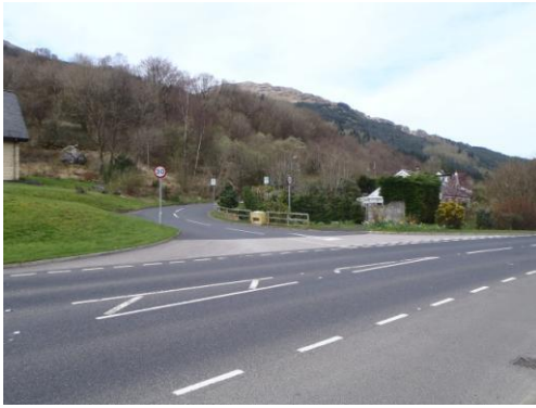
Fig. 3: A83 junction.