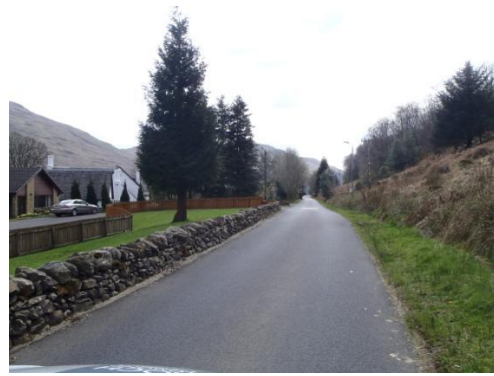
Fig. 4: Access road (looking towards A83)