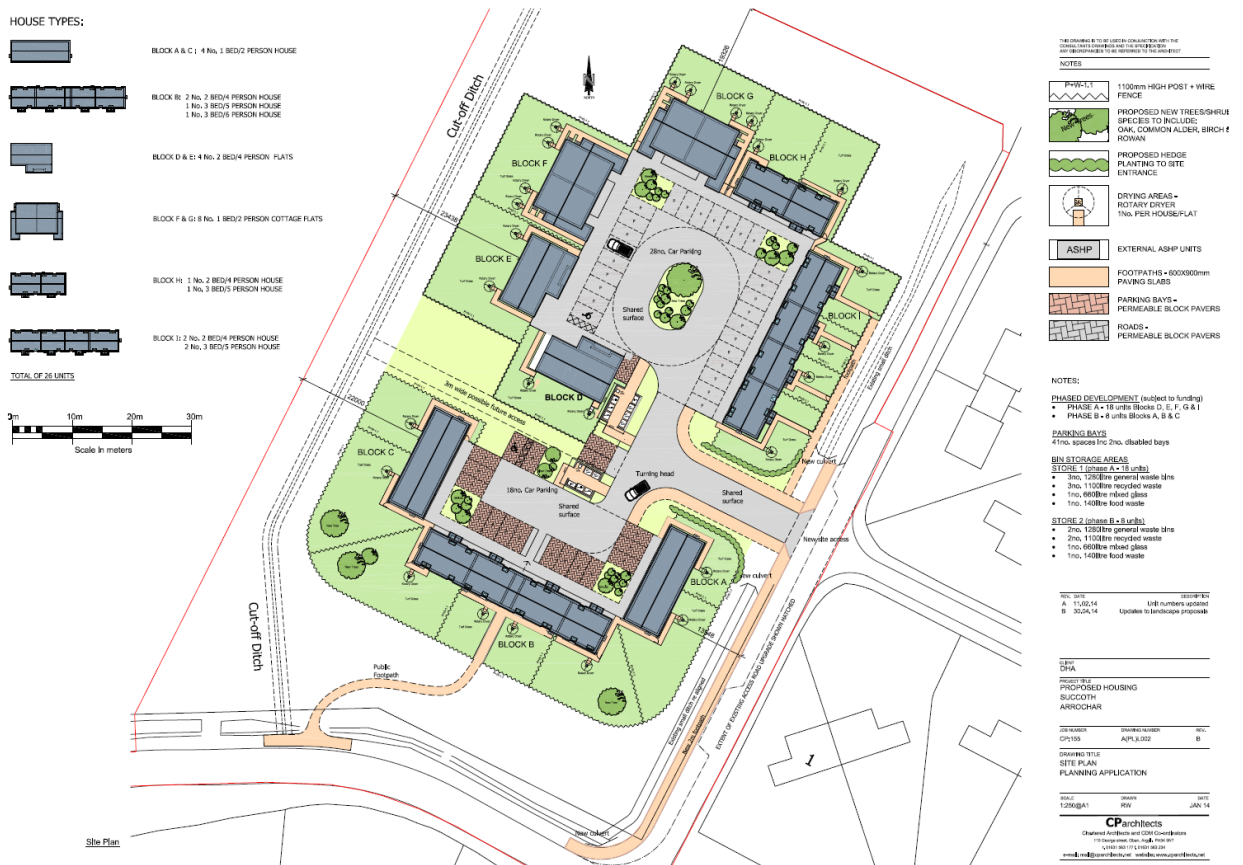
Fig. 5: Proposed layout.