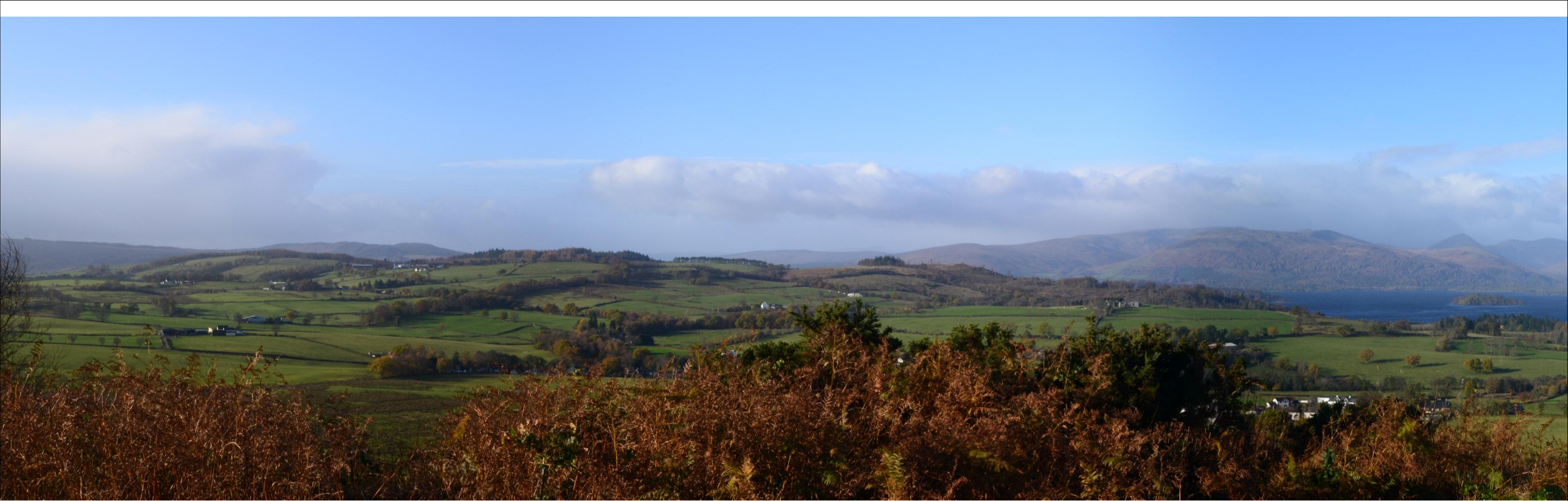
VP16 DUNCRYNE HILL - WIRELINE DRAWING