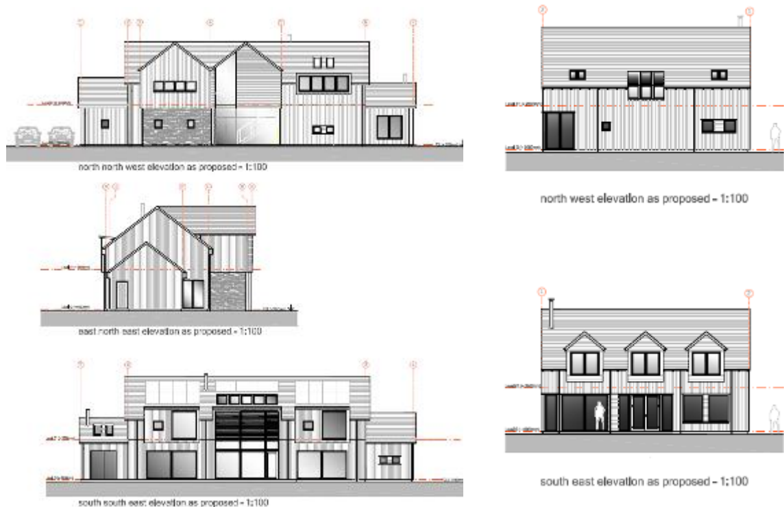
Figure 5. New House and Cottage Proposed Elevations (not to scale)