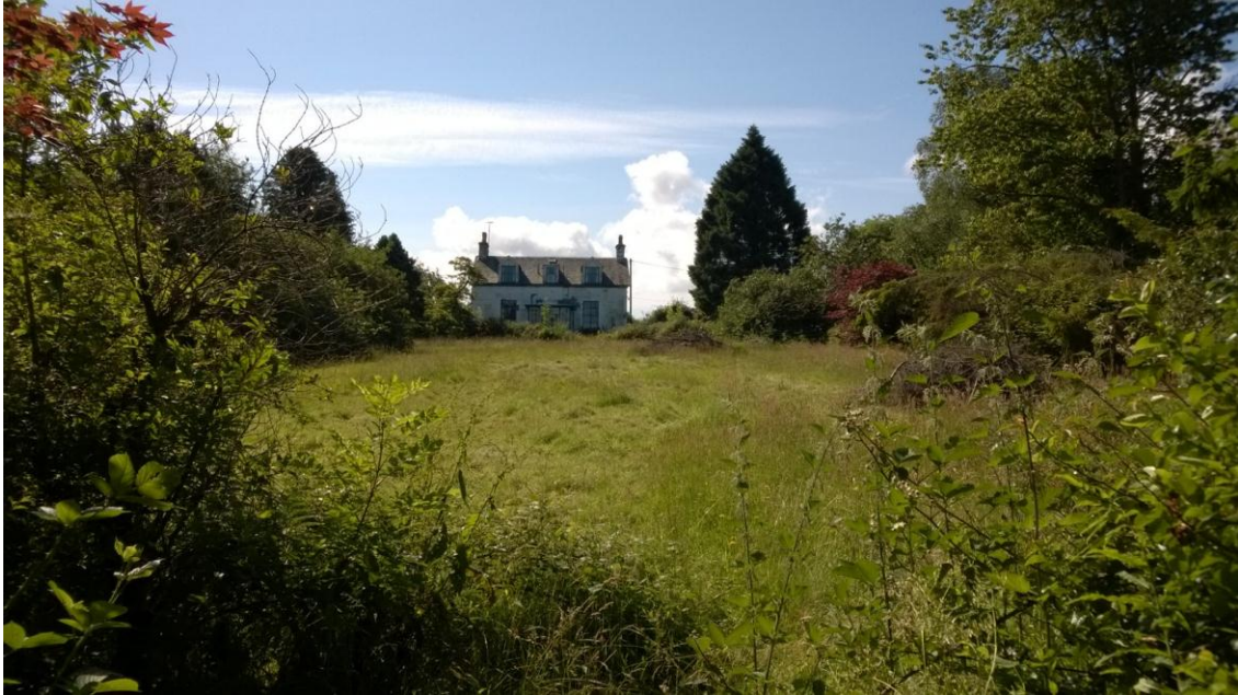
Figure 2. Photo of Existing House, Mansfield

3.2 The proposed development area is within an unmanaged area of woodland to the west of the existing house (see Figure 2). One plot would be to the rear, in line with Mansfield the existing house (known from now on as 'the house') and the other plot fronts the main road (known from now on a 'the cottage').