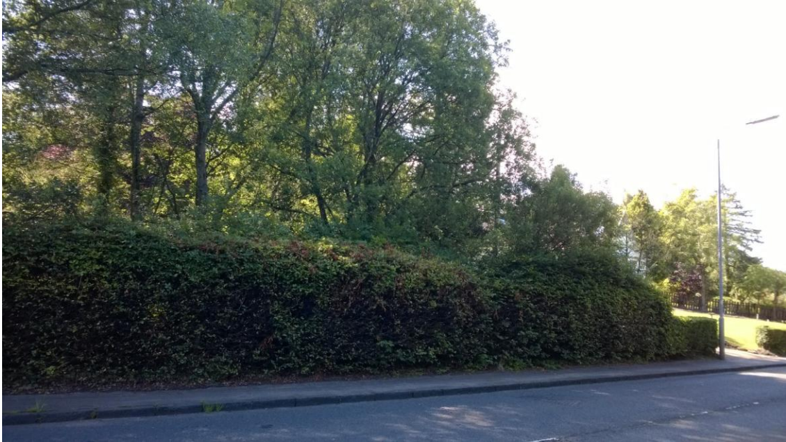
Figure 3. Photo of site of proposed cottage from the main road

3.3 To the southern (rear) boundary of the application site is an agricultural field. There are neighbouring properties of Dunelm (to the west) and Auchenreach (to the east) set forward on the same building line as the cottage plot. The neighbouring houses, Aber House and Robinhill, also have boundaries with the proposed house plots. The plot appears as a wooded site from the main road as can be seen in figure 3.