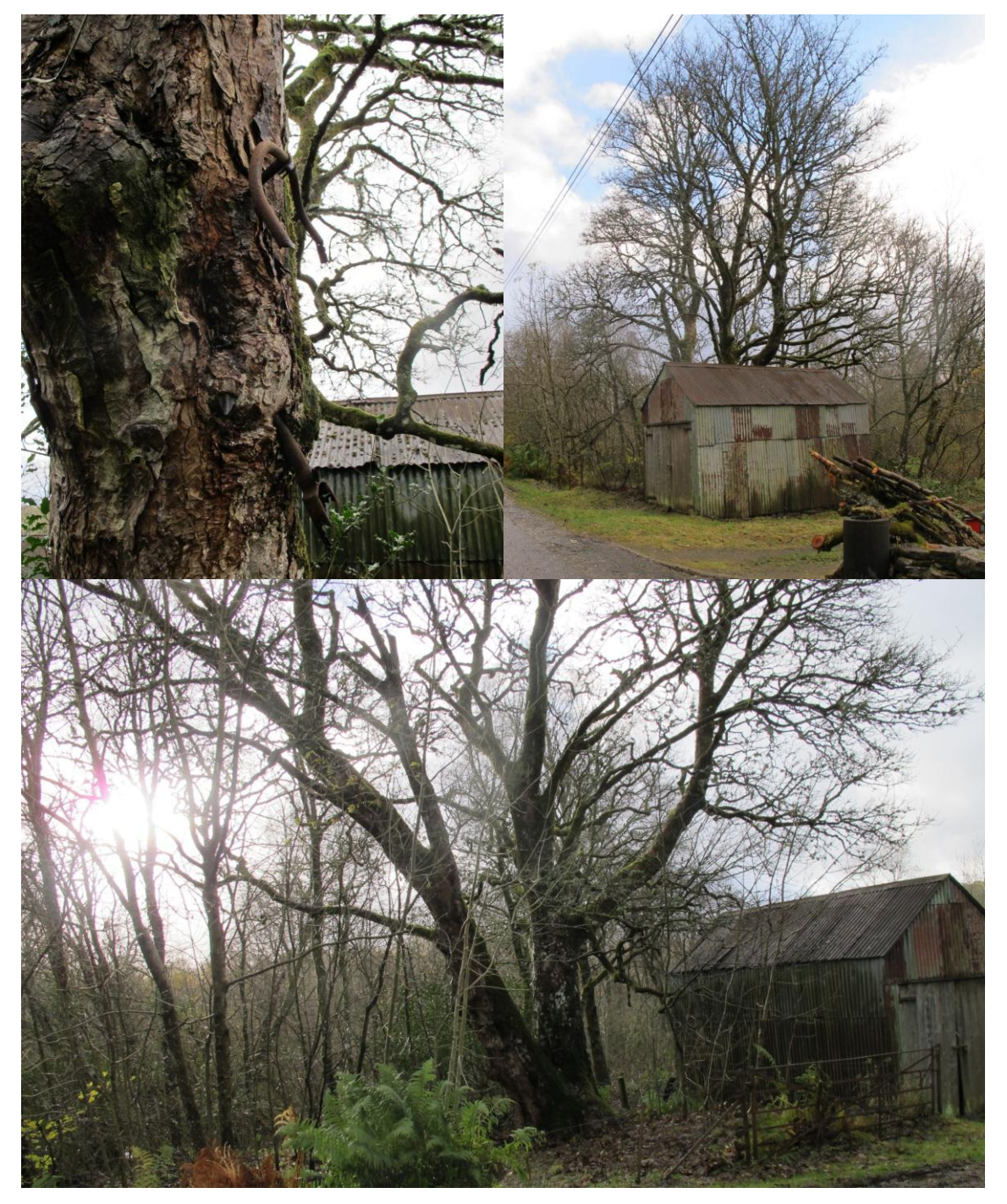
Figure 2: Photographs of the 'Bicycle Tree'

3.3 The adjacent field (in the same ownership) is currently unmanaged and is a mix of scattered trees and rough vegetation with the tree in question located at the north west corner of the field at grid reference (253459, 706752). The garage to the north west of