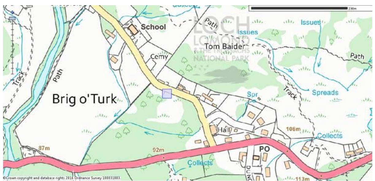
Figure 1 – Small Scale Location plan (Blue square - highlights tree's location)

3.1 The tree proposed for protection by a Tree Preservation Order is located in Dorothy's Field, Brig O'Turk which is located on the south side of the road leading through Brig O'Turk to the Glen Finglas dam opposite Rose Cottage (Figure 1 and 2).