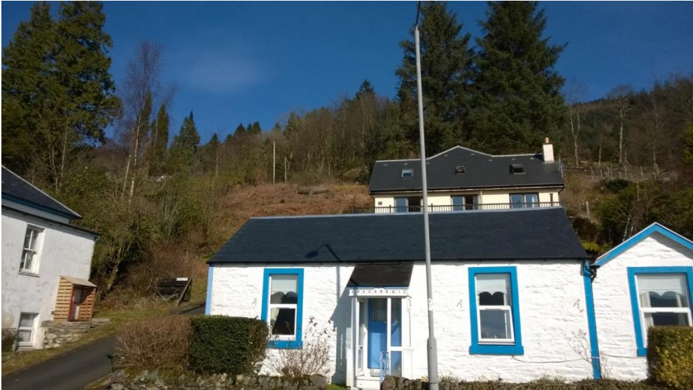
Figure 3 – Photograph of site

2.3 The site has a steep slope with the house known as Kasalito (at the rear in the photo - Figure 3) constructed at the south east corner and the remaining trees situated at the north east corner.