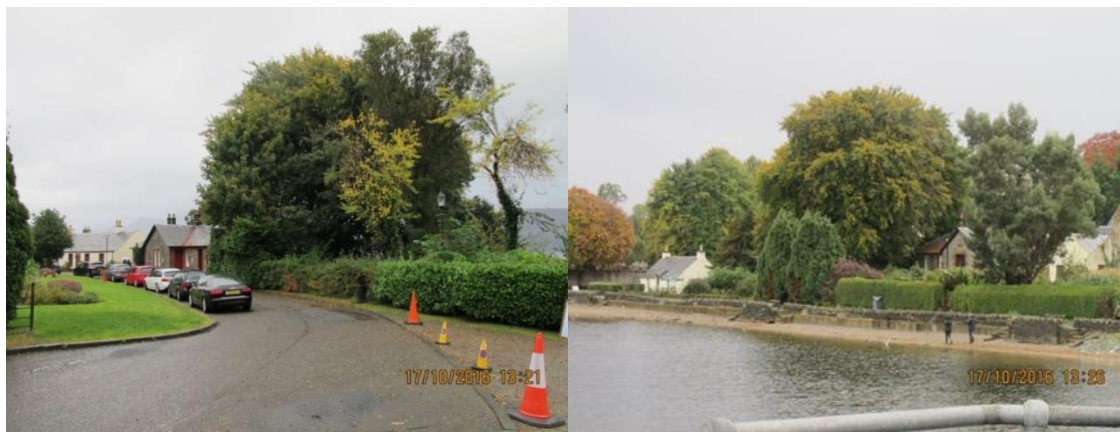
Figure 3 - Photographs