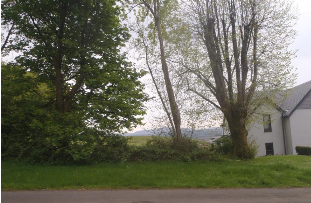
Figure 5 – Photograph of TPO (T1) – Lime tree north of ‘The Limes’