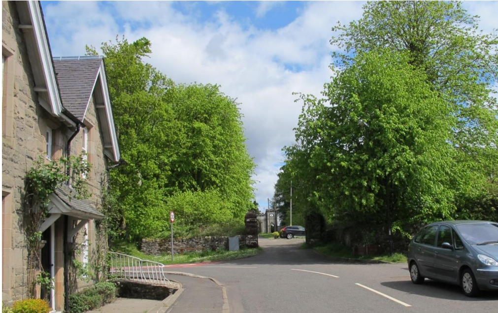
Figure 3 – Photograph of TPO – Avenue viewed from village Main Street