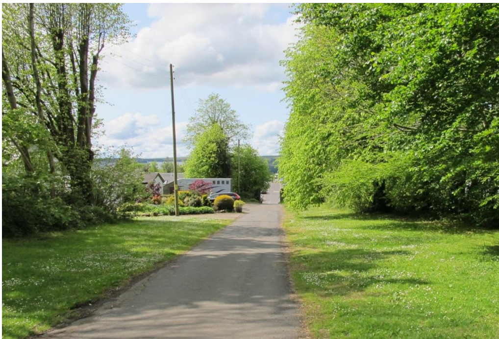
Figure 4 – Photograph of TPO – Gap in Avenue from removal of trees at the property known as 'The Limes'