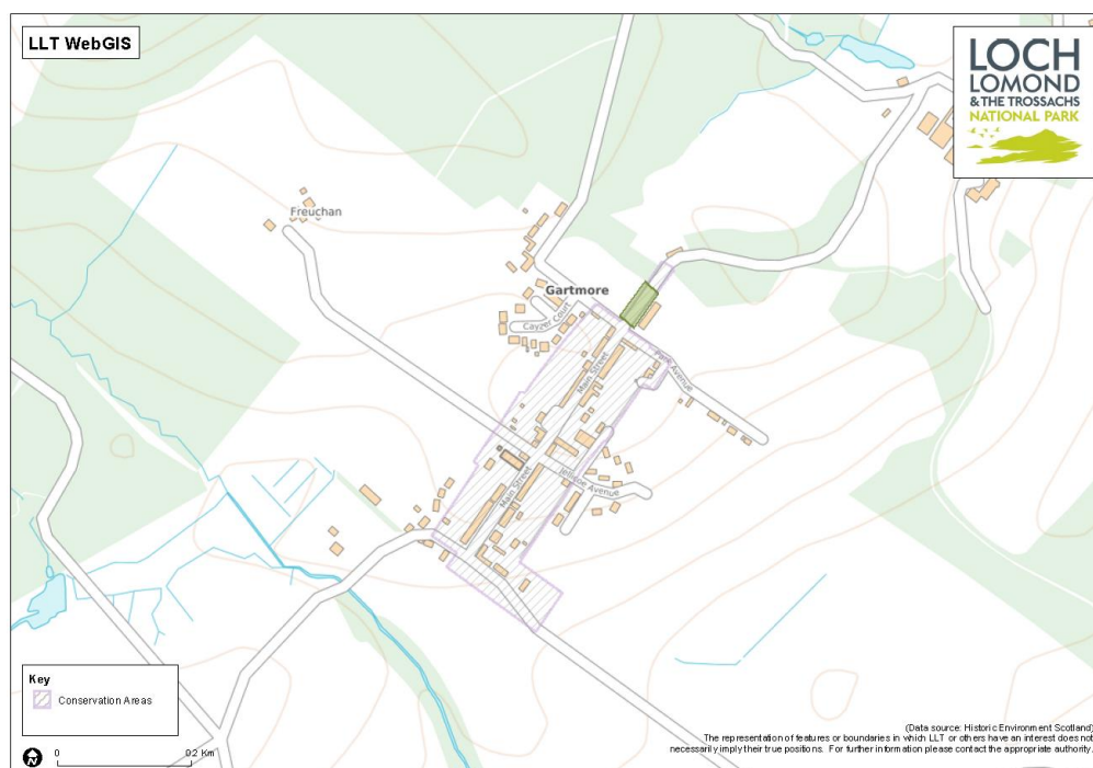
Figure 1 – Location Plan

2.1 The site lies at the north of the village of Gartmore at the entrance to Gartmore House. The trees are within the conservation area of Gartmore as shown on the location plan (Figure 1).