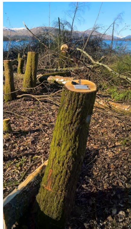
Figure 3 – Photographs taken on the 19 th March 2018 of the part of the site felled