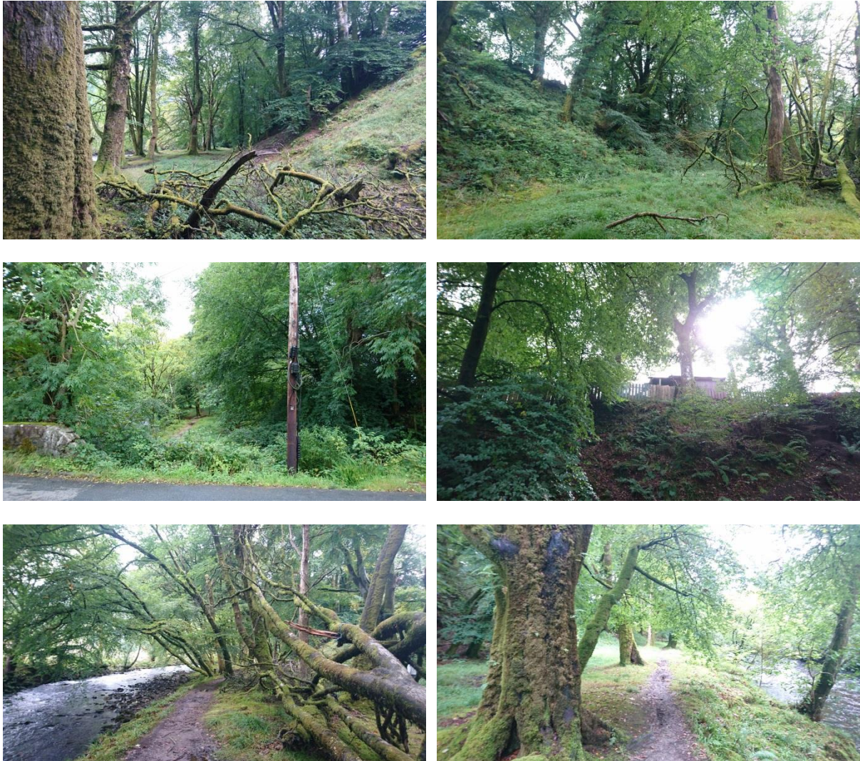
Figure 3 – Photographs of the site