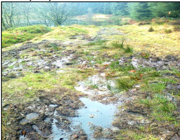
Rob Roy Way before & after

The Rob Roy Way restoration project has completed 1km of new path through the Invertrossachs area - making a welcome improvement on previous conditions.