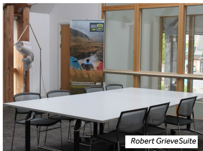
Robert Grieve Suite