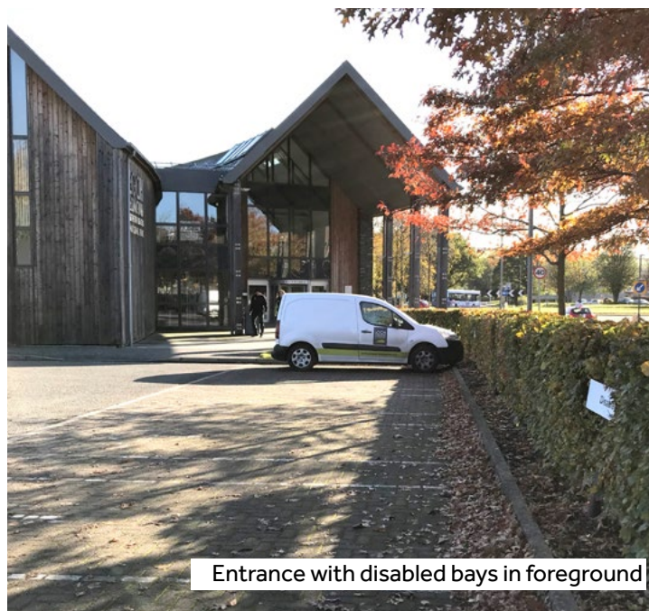
Entrance with disabled bays in foreground