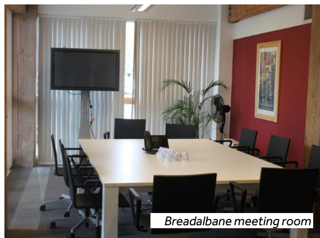
Breadalbane meeting room