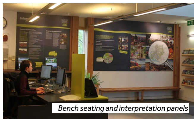
Bench seating and interpretation panels