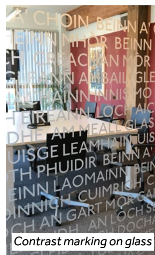
Contrast marking on glass