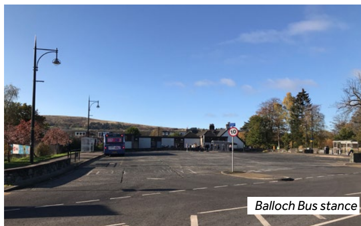
Balloch Bus stance