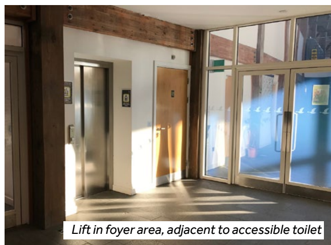
Lift in foyer area, adjacent to accessible toilet