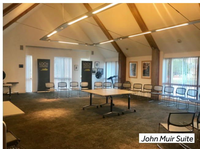
John Muir Suite