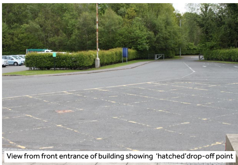
View from front entrance of building showing 'hatched' drop-off point