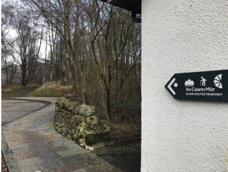
Route signage from the Visitor Centre to An Ceann Mor