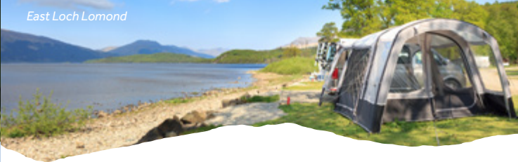
East Loch Lomond