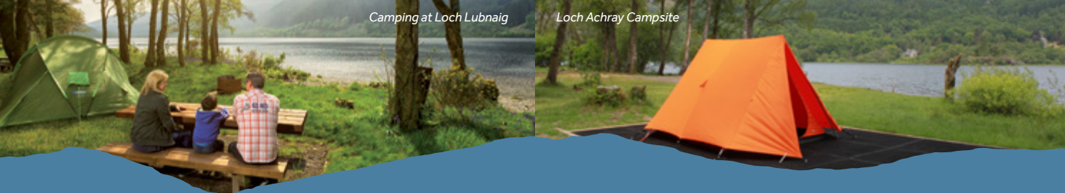
Camping at Loch Lubnaig