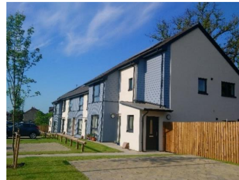
Balloch, Dumbain -26 homes