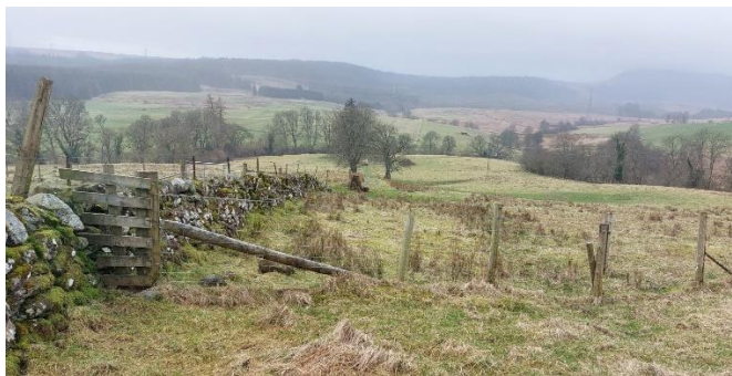
Gate replaced by fence, 2023