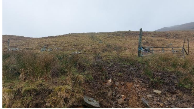
After: 5m wide gap in deer fence