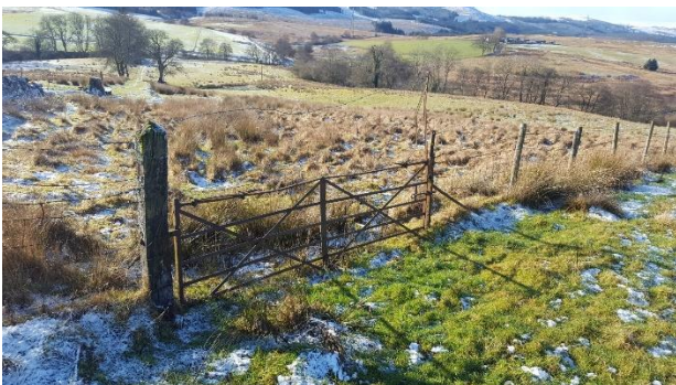
Previous gate in 2019, blocked with barbed wire

We have drafted a letter to the landowner explaining the current situation and that if he doesn't contact us by the end of May, we will use the powers available to us to enter his land and replace all the padlocked and broken gates.