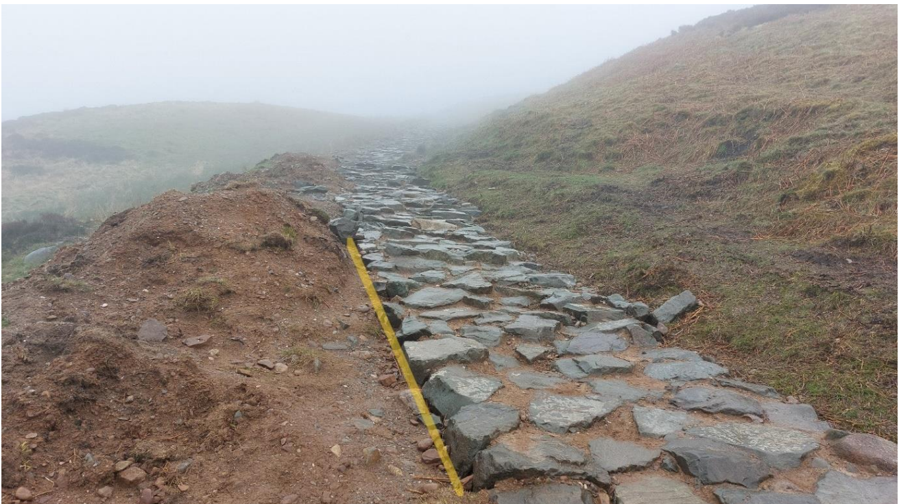
Photo 1: Packed and pointed pitching. Spoil to be reformed to revet downslope side of the path (yellow line).