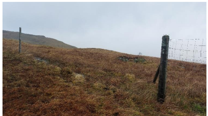
After: 5m wide gap in deer fence

We have developed advisory signs for either end of the diversion and the landowner has agreed with these. We will get them manufactured as soon as possible and the Land Operations Team has agreed to install them with some additional waymark posts to keep people on route.