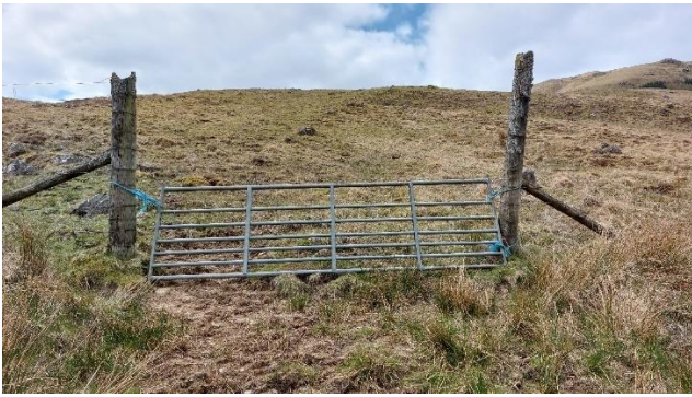
Before: broken gate and deer fence

landowner contacted us on 14 January 2024 to say he had opened the diversion route, and a site visit on 1 February confirmed this (see photos).