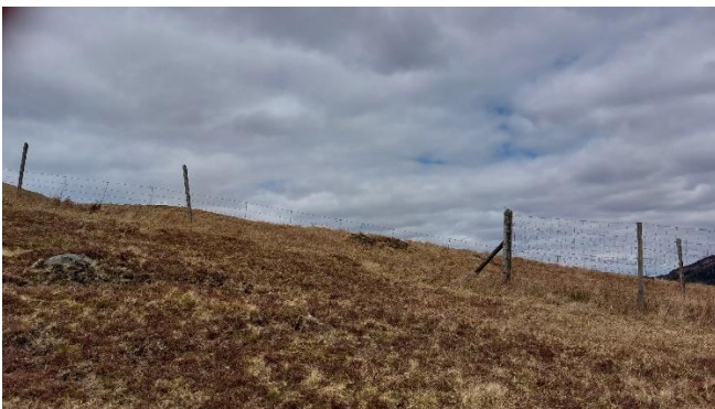
Before: half height deer fence obstruction