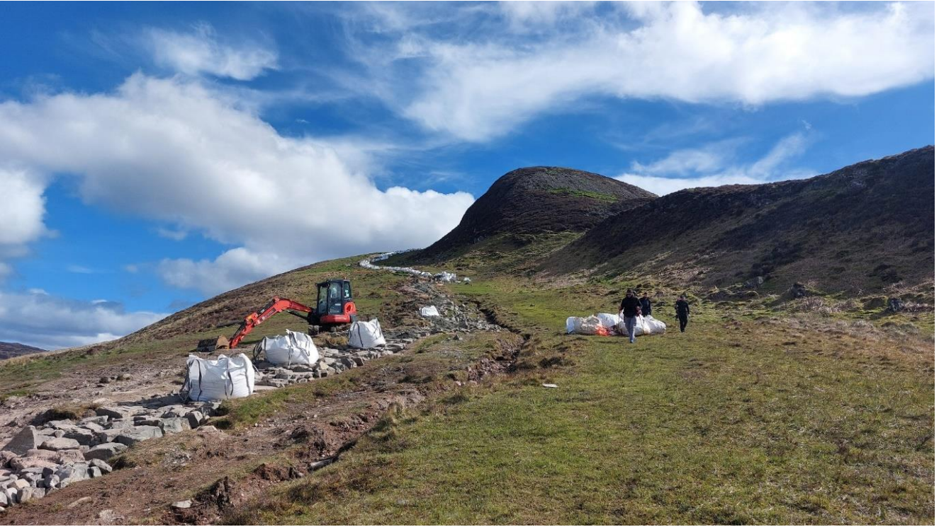
Photo 4: Stone bags on upper path and aggregate for packing already pitched path, 25 April 2024