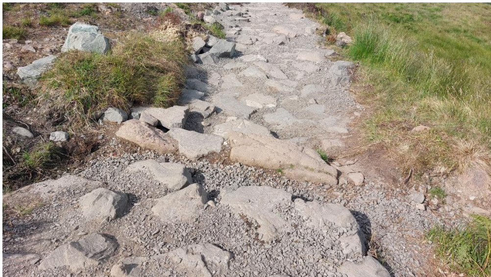
Excess gravel to be swept off path surface, 9 July 2024