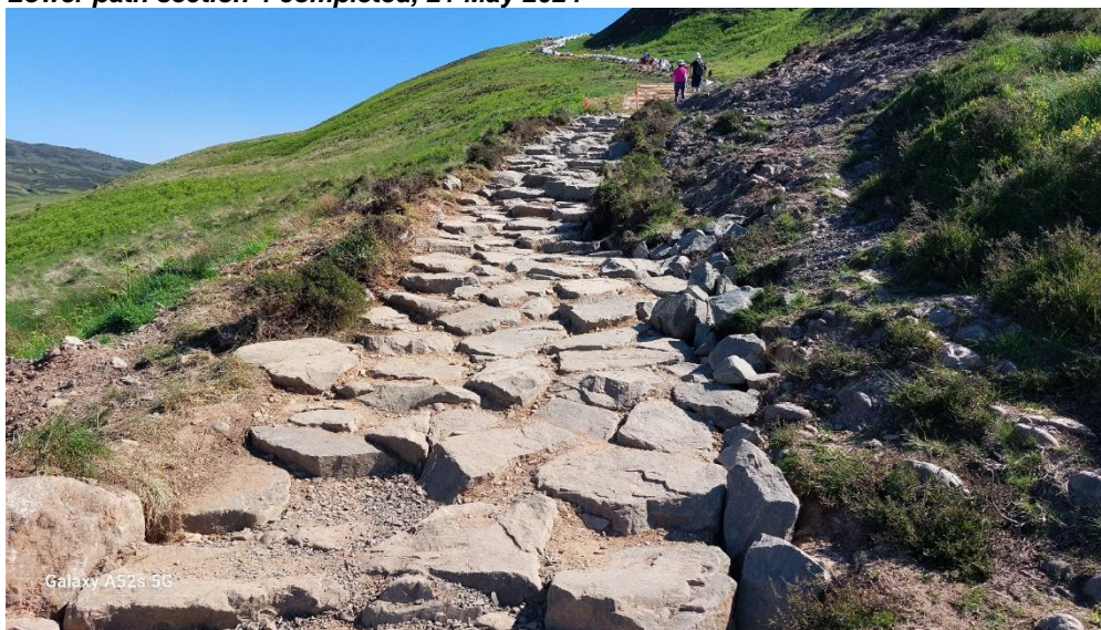
Completed pitching and landscaping, 21 May 2024