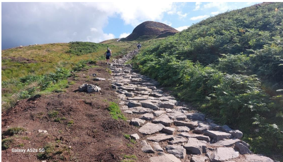
Trampling of landscaped path edges, 23 July 2024