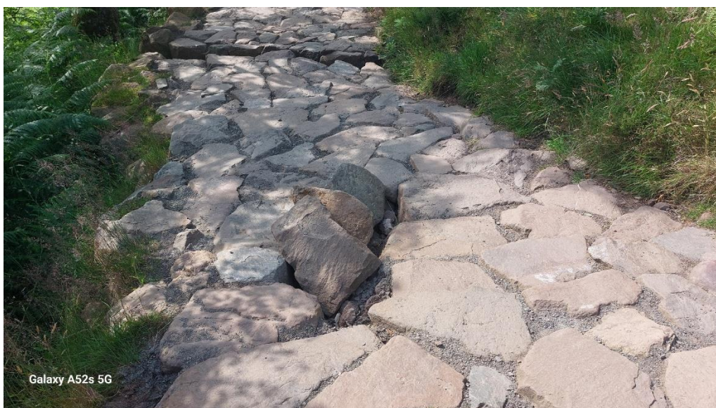
Pitching stone pulled out on path section 2, July 2024