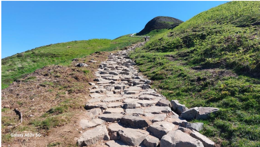
Lower path section 4 completed, 21 May 2024