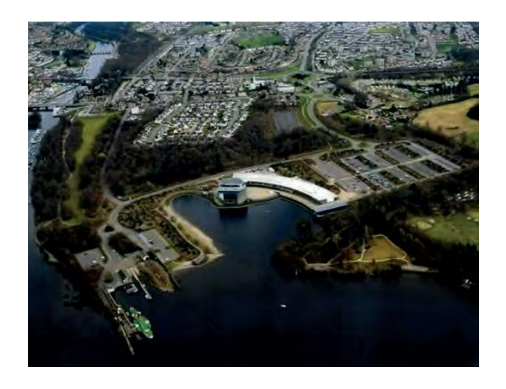
Figure 6: Balloch 2000s - taken from applicants' design statement