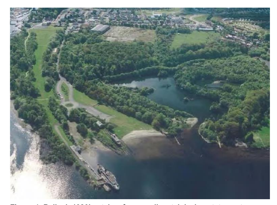
Figure 4: Balloch 1980's - taken from applicants' design statement