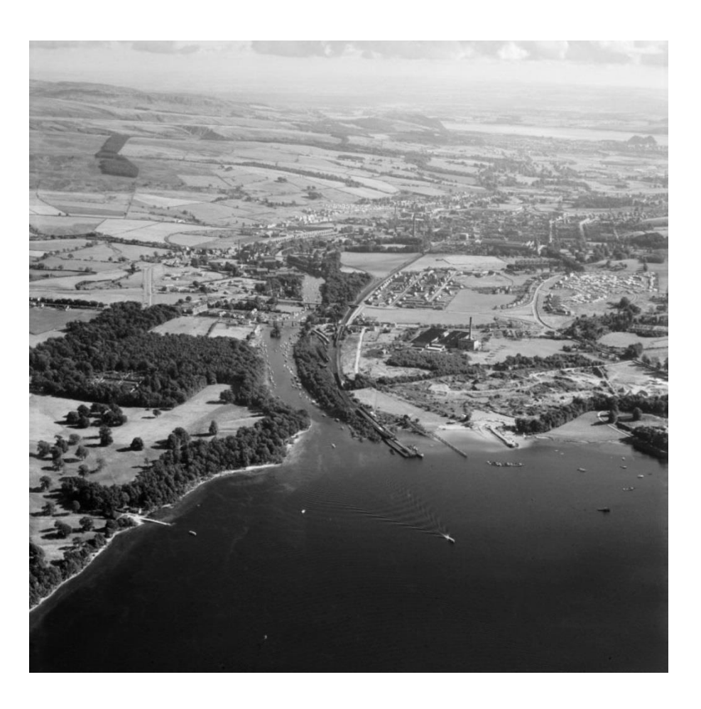
Figure 2: Balloch 1949 – taken from applicants' website (https://www.iconicleisuredevelopments.co.uk/index.php/photo-gallery/)