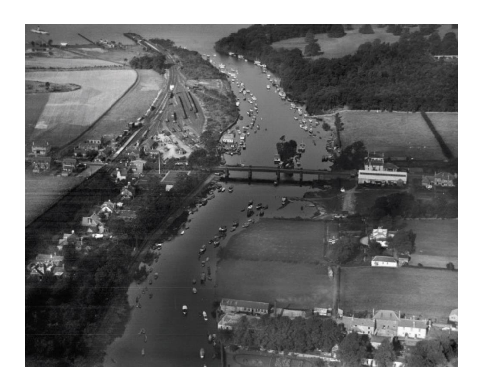
Figure 1: River Leven and Balloch Bridge, 1920's