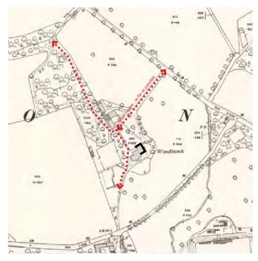
Figure 8: Woodbank House and setting circa 1918 - extracted from applicant's design statement