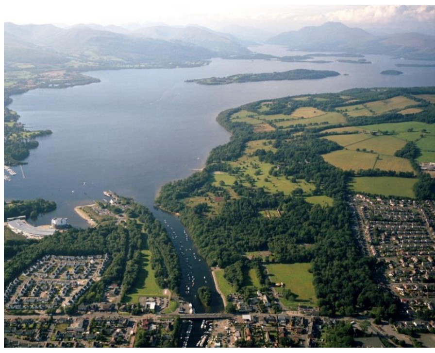
Figure 5: Balloch 2016 - taken from Balloch Charrette Report