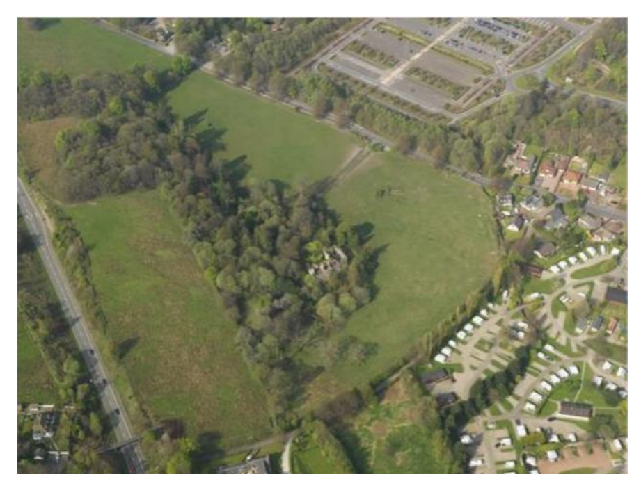
Figure 7: Aerial Photograph of Woodbank House taken circa 2009