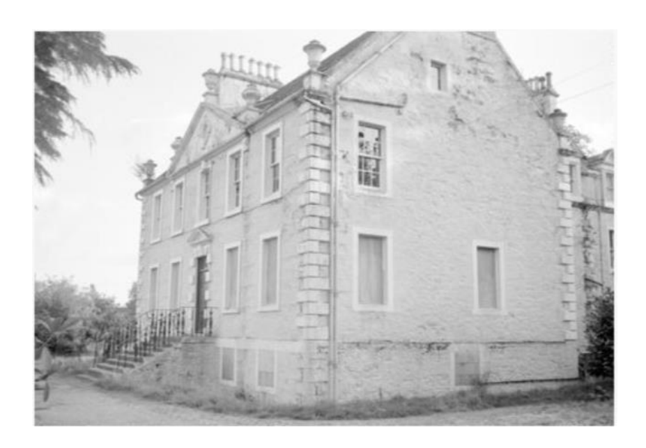
Figure 9: Woodbank House (formerly Hamilton House Hotel), 1983